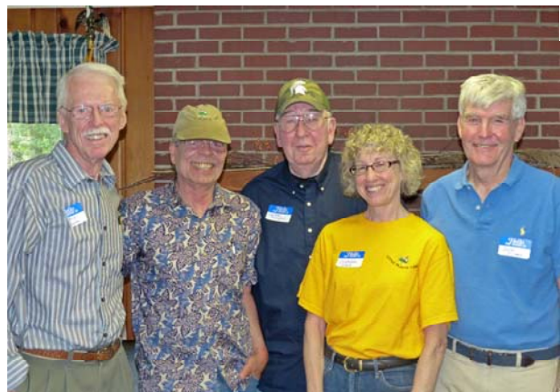
The 2014 LPLA Board