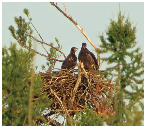
Chicks on the new Bald Eagle nest.