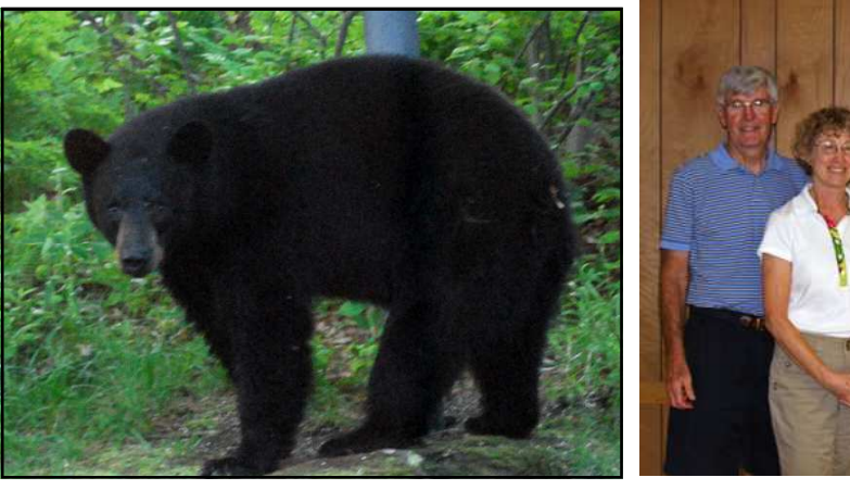
of a frequent spring visitor at Dunes Edge

Minutes of the meeting and further information about LPLA can be found at <u>www.littleplattelake.org</u>.