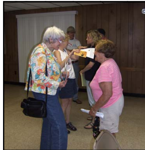
LPLA members socialize after the business meeting.